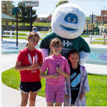
Rosecrest Splash Pad