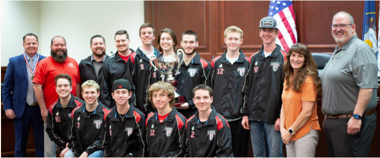
April 12 - Mountain Ridge High School Hockey State champions in only their third season

The City Council regularly recognizes individuals, groups, and teams from our community for their accomplishments, good deeds, and other ways they add to our amazing community.