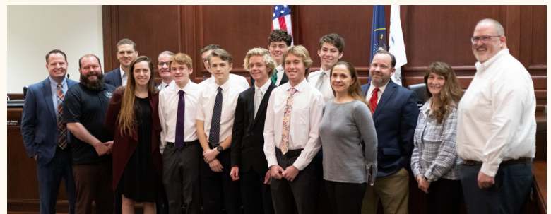
March 8 - Herriman High School Boys Cross Country Finished 3rd place at the Nike Cross National races